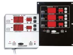
Easy to use slimline control panels, with adaptable positioning and proven reliability.