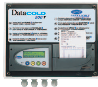
DataCOLD 500 is available in T version for outside trailer installation, and R version for installation in-cab.